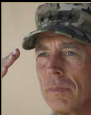
Semper Fidelis Award Dinner General David H. Petraeus February 25, 2012